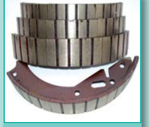
Sintered brake shoes Škoda 130 RS