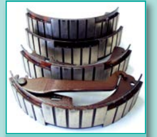
Brake shoes Opel Kadett Coupé 2.0