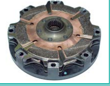
Clutch kit LIGIER