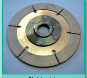
Clutch plate DALLARA F 2000, 2x140 mm