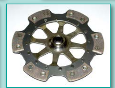
PORSCHE CARRERA GT 3