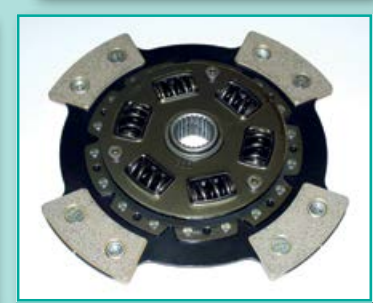
HONDA CIVIC VTI