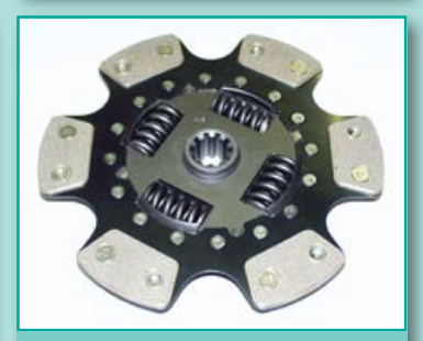
BMW 535 i