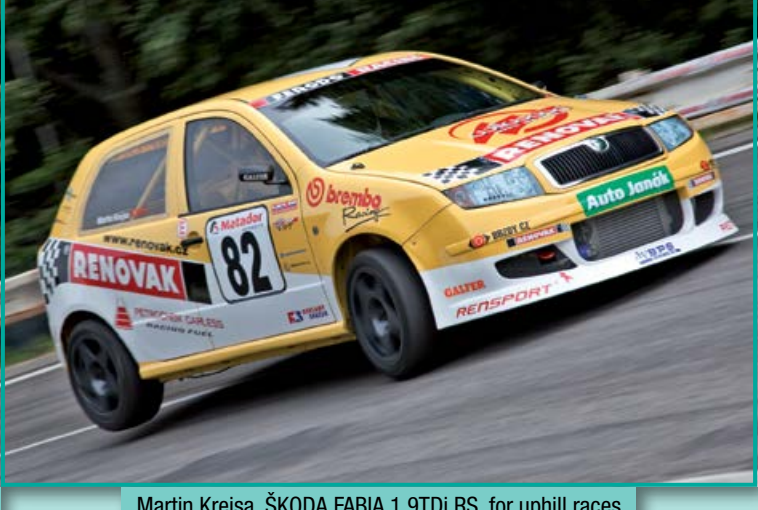
Martin Krejsa, ŠKODA FABIA 1.9TDi RS, for uphill races

We have been producing and adjusting the high performance sintermetallic and cerametallic clutch driven plates for many years in order to help to our customers to achieve extreme performance and to widtstand high torques on their vehicles. Our product supply starts from the clutches for very light cars as for example for light single seat cars to very heavy trucks for rallye raids. For tunned vehicles we adjust the clutch driven plates even with keeping the standard OE dimensions. Also, we are producing the sintered brake shoes for historical vehicals in order to withstand higher temperatures, while keeping the required friction properties. All those products are delivered under our registered trademark RENSPORT.