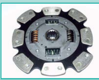
Clutch plate adjustement Off-road Toyota Landcruiser 4,2 TD