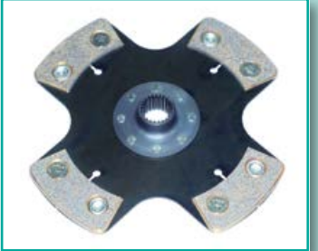
BMW 1150 GS Adventure - RENSPORT